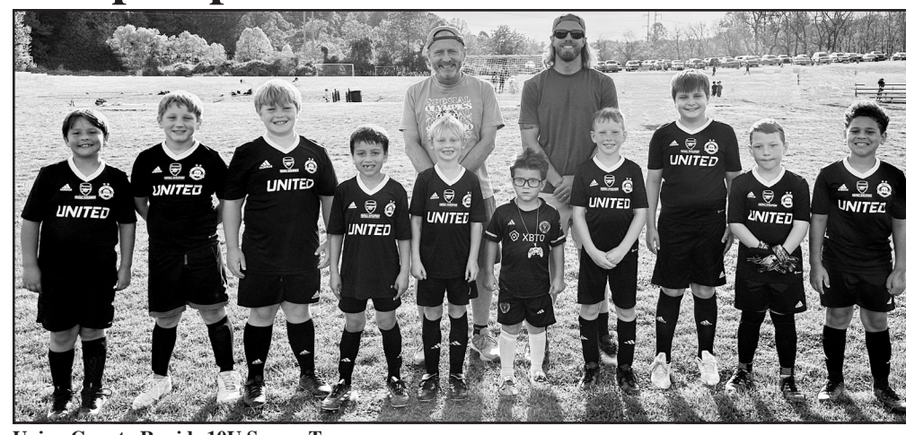
Union County Rapids 10U Soccer Team

The 10U Union County Rapids soccer team closed out their impressive season with a dominant 8-1 record, showcasing teamwork, grit, and a deep bench of young talent.